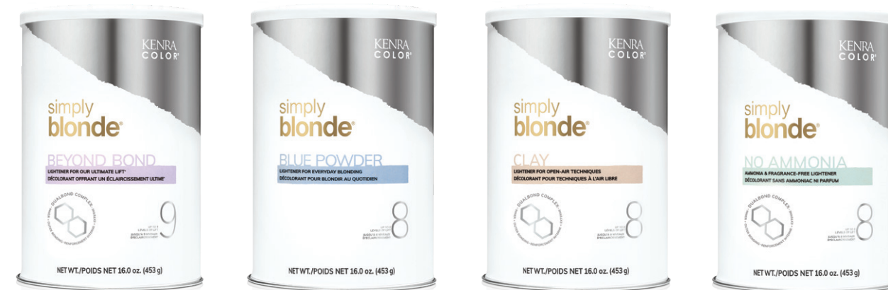
BEYOND BOND LIGHTENER